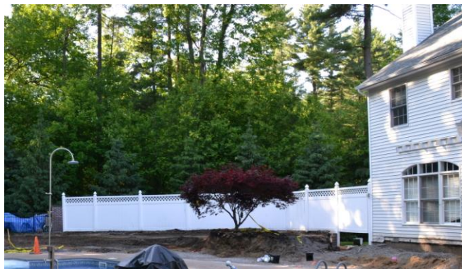
Early construction, with specimen tree

As most people, the client did not want to exceed a certain budget for fear of over-investing and surpassing the real estate/market value of the property. With Redbud's broad design capabilities and our willingness to collaborate with other design professionals, such as architects, interior designers, lighting specialists, etc... we were able to design 3 different concepts with rough budgets for each. The client found an acceptable combination of elements that answered most of their needs. We were even able to design an adjustment to their interior layout that they can implement later to double as a mudroom and changing area for the pool; thereby saving the client money and adding real value to their home.